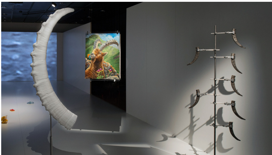
View of the exhibition “Displacements – Art, Science and the DNA of the Ibex”

Art meets science at the UZH Zoological Museum: Students from Zurich University of the Arts present their interpretations of genetic and ecological research on the ibex. In close dialogue with researchers at UZH and the Swiss Federal Institute for Forest, Snow and Landscape Research, they have created a wide variety of works, all waiting to be discovered at a special exhibition entitled “Displacements – Art, Science and the DNA of the Ibex.”